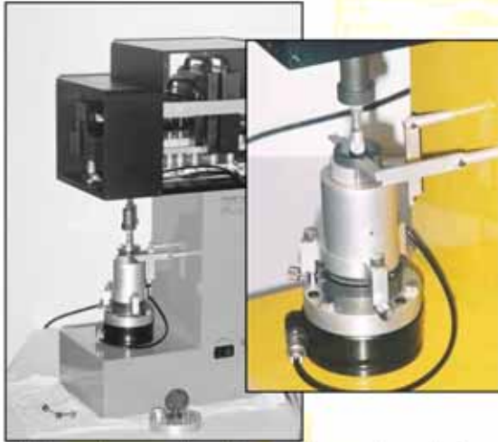
Automatic powder flow rotary shear tester with standard rotational split cell.