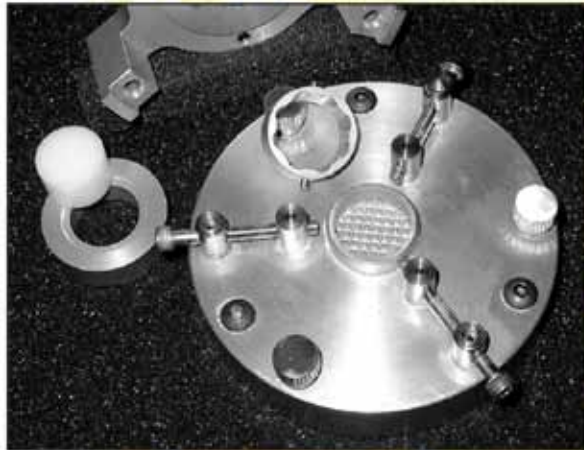
Small volume split cell.